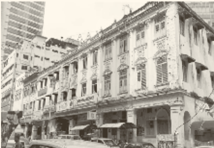
Unique Pre-war 3-storey multi-colored shop houses

Located approximately 20 minutes walking distance away from Hotel Stripes Kuala Lumpur, you will find the original Little India, Lebu Ampang. A small 500M stretch of road where one can enjoy the unique architecture of Kuala Lumpur's past, indulge in the rich Indian traditional wear and accessories, and even savour the delicious authentic Southern Indian cuisines.