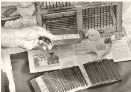
Read your fortune by experiencing the art of 'Kili Josiyam' or Parrot astrology