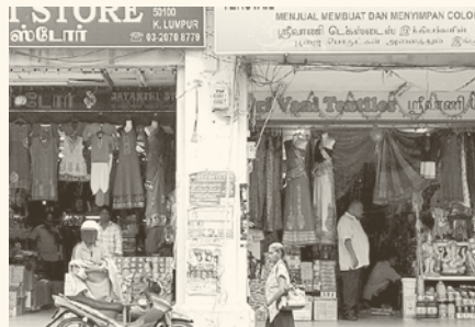
Dozens of shops selling traditional indian wear and authentic Southern Indian food