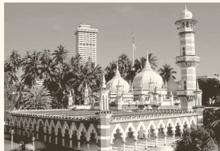
JAMEQ MOSQUE - Nearly 110 years old, built on the confluence where the two rivers, Klang and Selangor River meets, this is indeed a must visit when you are in Kuala Lumpur. Open daily to visitors (except on Fridays) from 9am to 12.30pm and 2.30pm to 4pm